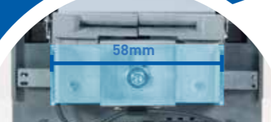
Paper Channel with tension unit

Software controlled illuminated paper mouth with status LED. Two integrated buttons for testprint and paper feed.