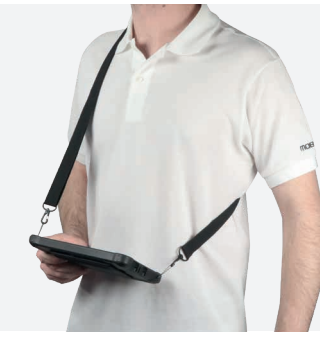
For typing in standing position