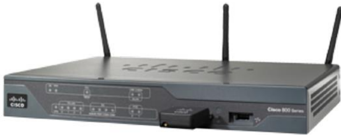
Figure 1. Cisco 880G Series 3G Wireless Integrated Services Routers

With enhanced data rates and improved latency (below 100 milliseconds), WWAN services are an ideal way to supplement traditional wire line services. 3G WWAN data services offered today have average data rates well in excess of ISDN speeds, with theoretical limits in excess of 7 Mbps on the downlink and 5 Mbps on the uplink. The 3G WWAN can be use as a primary link for sites with lower bandwidth requirements and for mobile applications. The 3G WWAN data services can also be use as a cost-effective alternative in areas where broadband services are either not available or very expensive. Cisco is building on these performance milestones and adding support for wireless to our wide variety of WAN interface alternatives.