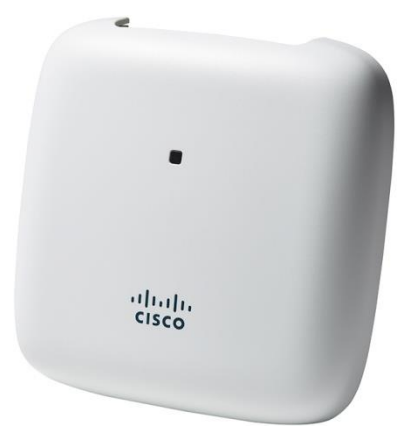
Figure 1. Cisco Aironet 1815m

With the increased coverage area, 802.11ac Wave 2 support, and the functions and features of an enterpriselevel access point, the 1815m fully meets the growing requirements of wireless networks by delivering a better user experience (Figure 1).