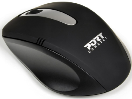
2,4 Ghz Wireless technology Technologie sans fil 2,4 Ghz