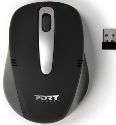
USB receiver with mouse storage Stockage avec récepteur USB dans la souris