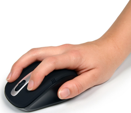
Ultra-compact ambidextrous design Design ultra-compact et ambidextre