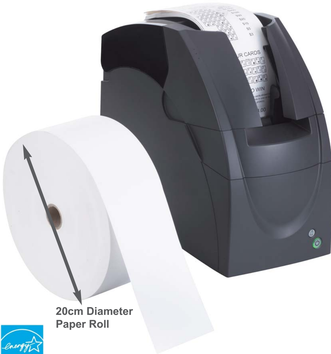
20cm Diameter Paper Roll

The World's "Best" Lottery Printer / Secure Transaction Printer with 100 Ticket Stacker