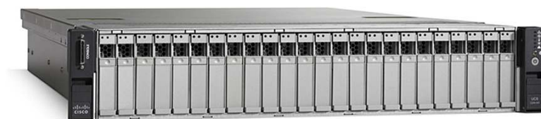
Figure 1. Cisco UCS C240 M3 Server

The Cisco UCS C240 M3 interfaces with Cisco UCS using another Cisco innovation, the Cisco UCS Virtual Interface Card. The Cisco UCS Virtual Interface Card is a virtualization-optimized Fibre Channel over Ethernet (FCoE) PCI Express (PCIe) 2.0 x8 10-Gbps adapter designed for use with Cisco UCS C-Series Rack Servers. The VIC is a dual-port 10 Gigabit Ethernet PCIe adapter that can support up to 256 PCIe standards-compliant virtual interfaces, which can be dynamically configured so that both their interface type (network interface card [NIC] or host bus adapter [HBA]) and identity (MAC address and worldwide name [WWN]) are established using just-in-time provisioning. In addition, the Cisco UCS VIC 1225 can support network interface virtualization and Cisco® Data Center Virtual Machine Fabric Extender (VM-FEX) technology.