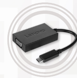
Lenovo USB-C to VGA Adapter