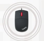
ThinkPad USB Laser Mouse