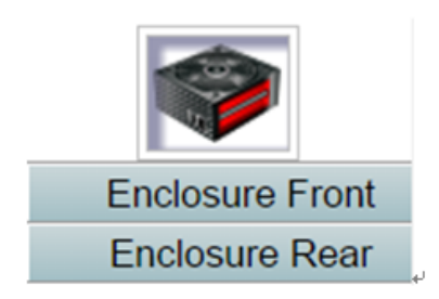
Figure 2. Enclosure

Summary page displays overall enclosure status and information.